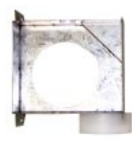
Model Shown is BF-703BA